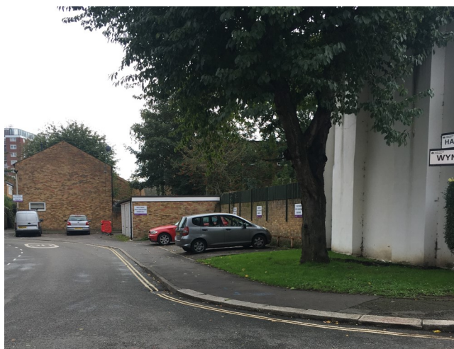
View of the site from Silverhall Street